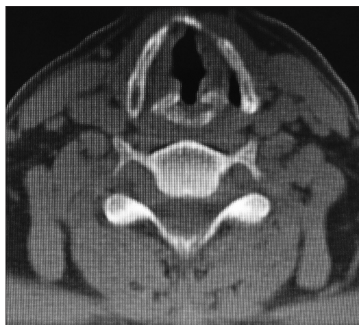
Figure 2: CECT neck showing thickening and irregularity over the bilateral cords

Laryngeal tuberculosis is a disease known to us since a long time. Although the incidence is decreasing in affluent countries with the advent of Anti-Tubercular Treatment and improved socioeconomic conditions, it still continues to be a public health hazard in developing countries.