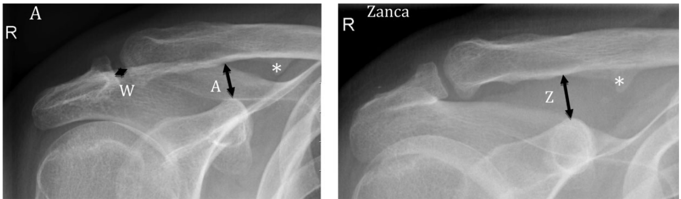
Figure 2. A standardized radiograph showing the variables measured in the study patients: acromioclavicular joint (ACJ) width in the middle of the joint (W), elevation of the lateral edge of the clavicle in both anteroposterior (A) and Zanca projection (Z), osteoarthritis in the ACJ, the presence of osteolysis in the lateral clavicle, and the presence of calcification (*) in coracoclavicular ligaments.