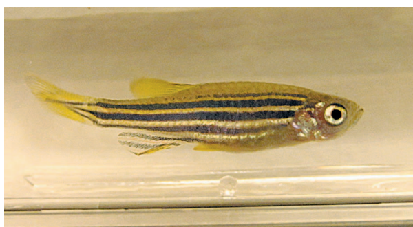
Figure 2. The zebrafish, Danio rerio , is an important vertebrate model organism in eye research.

photoreceptor activity in the larval fish.