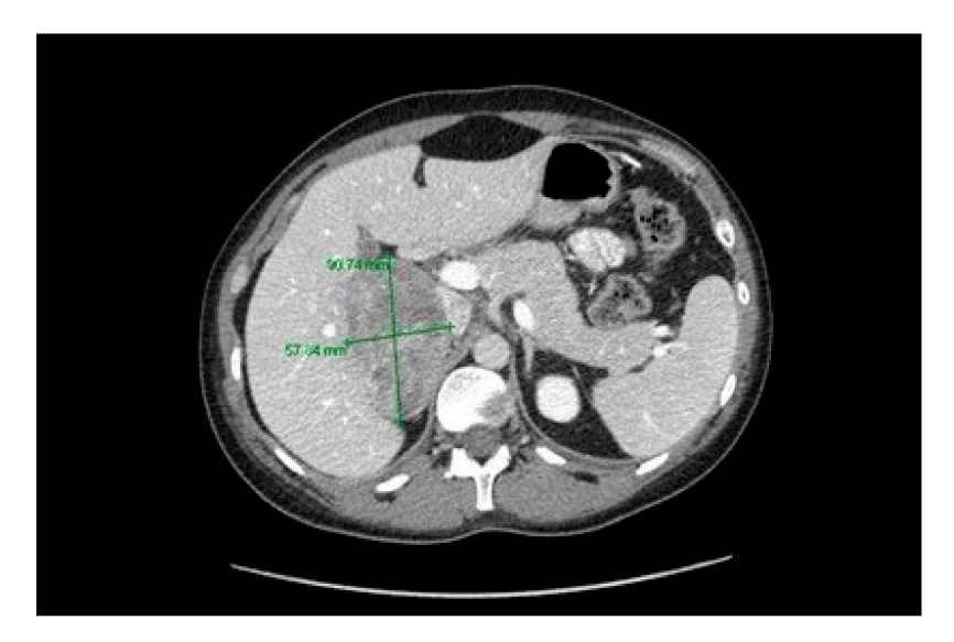
Figure 2. Computed tomography revealing the 9.1 × 5.8 cm right adrenocortical mass.