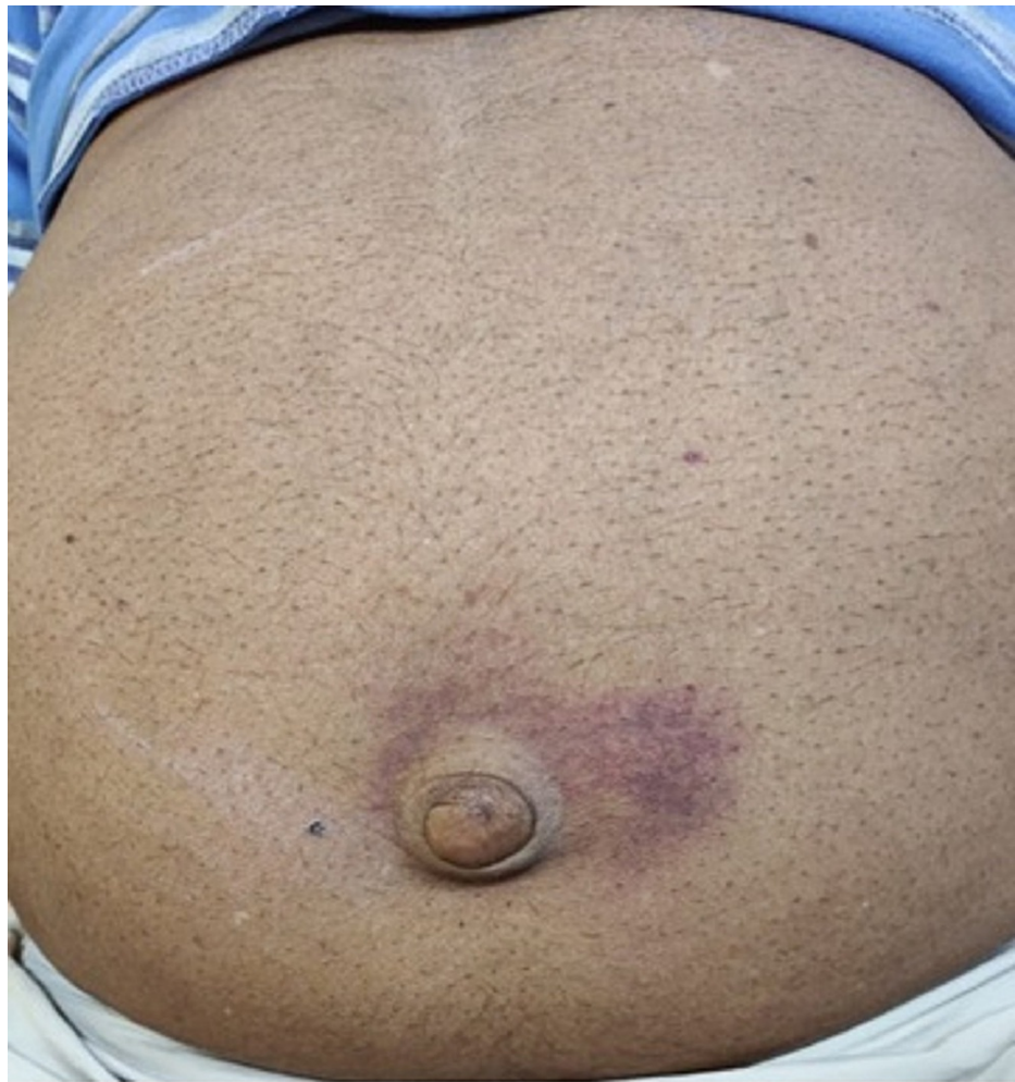
FIGURE 1: Periumbilical ecchymosis: Cullen's sign.