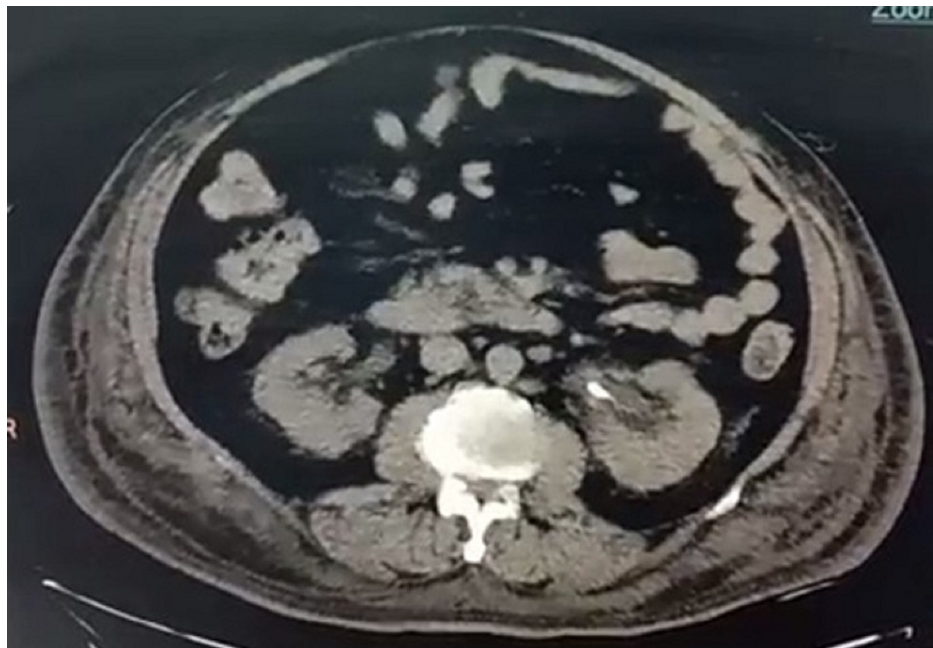
FIGURE 2: NCCT abdomen showing bilateral perirenal and periureteric fat stranding with left double J stent in situ.

nephric T2-weighted short-tau inversion recovery (STIR) hyperintense signal and a T1 hypointense cortical cyst in the left kidney at the lower pole (Figure 3). The urine culture was sterile, but the blood culture showed Klebsiella pneumoniae sensitive to cefepime and piperacillin-tazobactam.