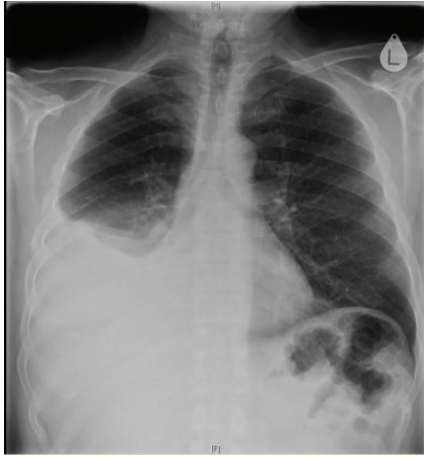
FIGURE 1: Large pleural effusion in the right hemithorax with probable collapse of right middle and lower lung lobes.