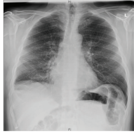
FIGURE 3: Chest radiography 6 months after diagnosis showing drastic improvement. The lungs were clear except for a small persistent right-sided pleural effusion. The cardiothoracic ratio and the mediastinal contours were unremarkable.

Despite intravenous antibiotics, no improvement in inflammatory markers was observed over the next few days, and the patient also spiked a temperature of 38°C. The patient initially refused to undergo a therapeutic pleural tap but eventually consented to having one six days into his admission. This time, the pleural fluid, which was again an exudate, had a pH of 6, in keeping with an empyema. Gram-positive rods were detected in the pleural fluid. Till now, the patient had been on levofloxacin and gentamicin. Antibiotics were initially switched to meropenem and teicoplanin but later when culture of the pleural fluid revealed Actinomyces meyeri