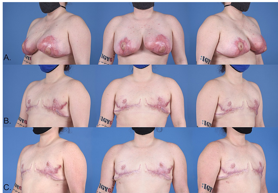
FIGURE 2: Row A: Healing bilateral PSPG wounds prior to mastectomy. Row B: Status post-mastectomy with free nipple graft. Row C: Post revision with fat grafting and tissue rearrangement.