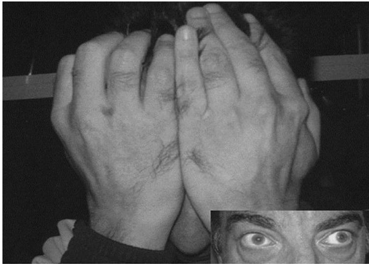
Fig. 1. Photography showing the patient's eye rubbing. The thenar eminence of both hands is vigorously compressed against the eyes. Bottom right: details of exotropia due to severe visual acuity reduction in the left eye.