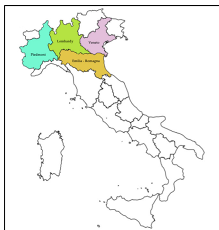
Figure 1. The most affected region during the first phase.

In May 2020, Italy had a total of 232,664 infections and 33,340 deceased, with 88,758 and 16,079, respectively, attributable to Lombardy alone, which in terms of percentage of deceased, was 48.23% of the national total (Table 2).