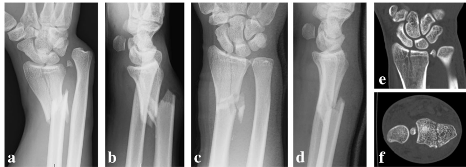
Fig. 1 Plain radiograph and plain computed tomography (CT) scan of the right wrist before and after manual reduction. (a) Anteroposterior (AP) view and (b) lateral view before manual reduction. (c) AP and (d) lateral views after manual reduction. (e) Coronal view and (f) axial view of the CT image of the distal radioulnar joint. The fragment of the ulnar styloid is trapped between the sigmoid notch and ulnar head

race. He had no remarkable medical history. A doctor he met had diagnosed him as having Galeazzi fracture-dislocation, and it was reduced manually (Fig. 1a, b). Subsequently, he was referred to us for further treatment. Preoperative plain radiography and computed tomography of the right wrist joint showed that the metaphyseal and articular fracture of the radius and the fragment of the ulnar styloid were trapped between the sigmoid notch and ulnar head (Fig. 1c-f).