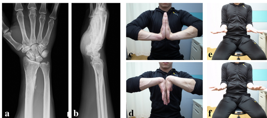
Fig. 5 Plain radiograph and clinical photograph at the final follow-up 15 months postoperatively. (a) Anteroposterior view and (b) lateral view of the right wrist. (c) Dorsal flexion of the wrist, (d) palmar flexion of the wrist, (e) pronation of the forearm, and (f) supination of the forearm

Kikuchi et al. reported a case of Galeazzi fracture-dislocation with an irreducible DRUJ due to entrapment of a fragment avulsed from the fovea of the ulna [4]. The fracture of the radius was treated with open reduction and internal fixation, but the ulnar head could not be reduced. Therefore, the ulnar head was exposed through a dorsal incision in order to reduce the DRUJ. Suspected mechanism of injury in our case was as follows: First, metaphyseal fracture of the radius occurred during a high-energy bicycle race. Second, after the radius was shortened, the dislocation of the DRUJ occurred, and it was accompanied by ulnar styloid fracture. The fragment of the ulnar styloid remained in its original position relative to the radius. Third, the doctor who treated it earlier could not manually reduce the ulnar styloid, but achieved reduction of the radius to some extent. Thus,