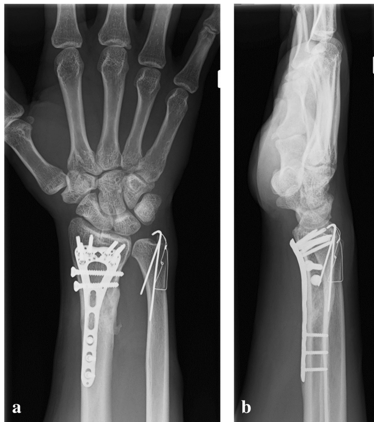
Fig. 3 Plain radiograph of the right wrist at 6 months postoperatively. (a) Anteroposterior view and (b) lateral view. Bone union of the radius and ulna is achieved

surgery. A daily injection of parathyroid hormone (PTH) (20 µg of teriparatide; Eli Lilly Japan K.K., Kobe, Japan) was administered 2 days postoperatively, and low-intensity pulsed ultrasound (LIPUS) (SAFHS 4000 J; Teijin Pharma Ltd., Tokyo, Japan) was performed 4 days postoperatively because he wanted an early return to competitive bicycle racing. He returned to professional bicycle racing 2 months postoperatively. Three months postoperatively, bone union was achieved. Because he complained of discomfort of the ulnar wrist due to irritation from the TBW, we performed implant removal of the radius and ulna and arthroscopy of the radiocarpal joint 9 months postoperatively. The arthroscopic findings showed that the TFCC maintained normal tension, as judged by results of a hook test, and the articular surface of the radius was repaired without cartilage injury [10]. (Fig. 4) At the final follow-up 15 months postoperatively, the patient was asymptomatic and returned to the preinjury level of athletic activity. Plain radiography showed bone union of the radius and ulna without osteoarthritic changes (Fig. 5a, b). Physical examination showed that the DRUJ was stable, and the patient's grip strengths were 64.0 kg and 60.6 kg for the right and left