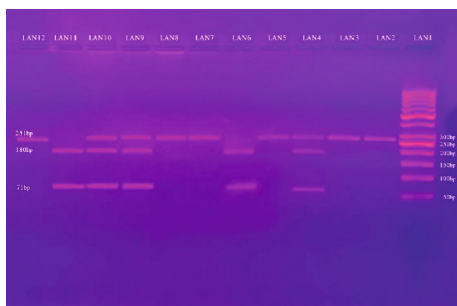
FIGURE 1: The products of TNF- \alpha promoter gene after digestion by BbsI restriction enzyme on gel electrophoresis. LAN (1): 50 bp ladder; LAN (2, 3, 5, 7, 8, and 12): TT genotype; LAN (4, 6, 9, and 10): TC genotype; LAN (6 and 11): CC genotype.

squared test, ANOVA test followed by post hoc Tukey's test, Kruskal-Wallis test followed by post hoc Dunn's test, Student's t -test, and Mann-Whitney test. The receiver operating characteristic curve (ROC curve) was performed to get the best cutoff for TNF- \alpha . The Spearman coefficient was used for correlation. For genotype distribution, the chi-squared test and Monte Carlo test were used. Odds ratio (OR) and confidence interval (CI) were calculated by logistic regression analysis. The level of significance was set at 0.05 or less.