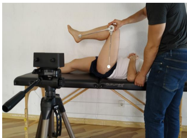
Figure 1. Measurement of knee joint range of motion for flexion.

A simple long-arm UG (Orthopedic Equipment Co., Bourbon, IN, USA) with a 360° scale, marked in one-degree increments, was used. The VS (Deportec, Murcia, Spain) is an optoelectronic system which acquires position data that provides knowledge on the angular amplitude at each moment during the performance of the joint movement, in order to obtain variables, such as the ROM. The VS comprises three elements: An infrared camera with a tripod, a laptop, and markers that are easy to attach to the skin. The camera, by the reflection of the infrared light, obtains the position (Cartesian coordinates (X, Y)) of the geometric center of the reflective marker, thus differing from video recordings done using traditional cameras. The camera was placed on an adjustable tripod stand at a 1–1.5 m distance from the participant and located at the height of the joint that was being examined (Figure 1). The VS can determine the angle formed by two bone segments (with three reference points: One joint axis and two references) or, alternatively, between a bone segment and the horizontal/vertical line drawn on the joint axis. Depending on the camera's proximity to the joint, the system's accuracy has been reported to be between 0.1° and 1° [16], without influencing other operating system properties.