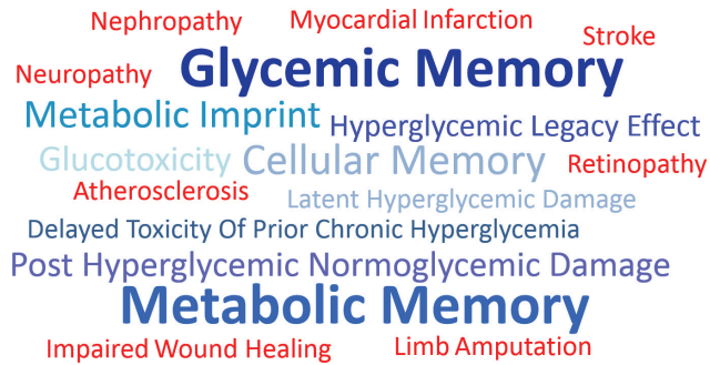
FIGURE 1: Word cloud illustrating diverse nomenclature for glycemic memory and associated diabetic complications.

term which refers to the delayed adverse effects triggered by prior exposure to glucotoxicity, lipotoxicity, and other metabolic imbalances. Because hyperglycemia is considered a key mechanistic driver for diabetic vascular complications and most in vitro experimental models have been based solely on high glucose exposure, here we endorse the term glycemic memory. However, metabolic memory is often used as an interchangeable term to describe this phenomenon, because it has been proposed that more than just tight glucose control is needed to prevent diabetic complications [13]. This review summarizes past and recent research on the role of glycemic memory in the prognosis of diabetic micro and macro vascular complications, covering from experimental in vitro models to human clinical trials. In addition, it discusses the relevance of epigenetics, with particular focus on how this might impact on endothelial progenitors as one of the cellular substrates of glycemic memory.