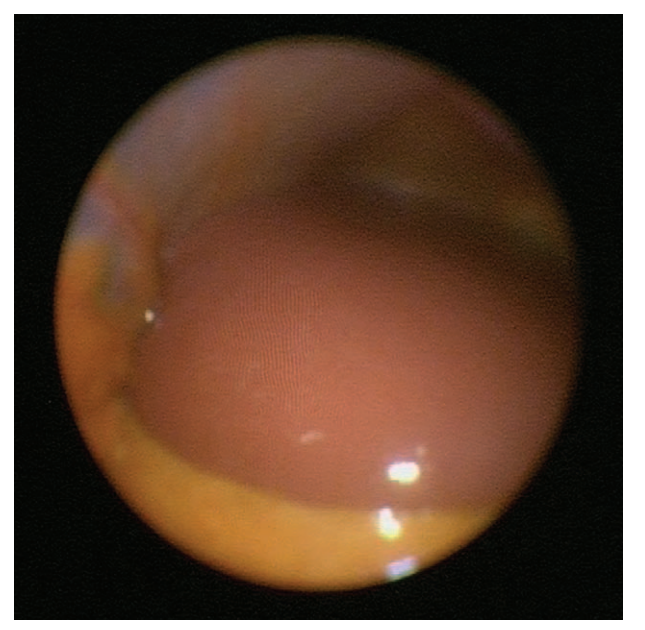
Figure 2. Mini-laparoscopy showing acute hepatitis with capsular swelling.

Acute hepatitis E can lead to a chronic hepatitis in immunosuppressed patients (HIV-positive patients, patients with hematological malignancies or patients following organ transplantation). This is defined by a HEV-RNA persistence for >6 months in serum. In case of an acute course, HEV-RNA