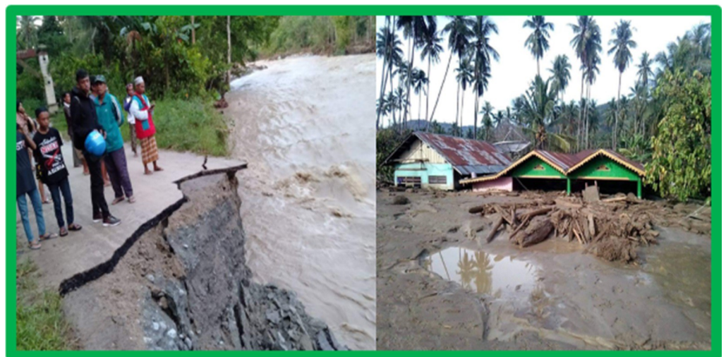
Fig 3. Sharing information by word of mouth attended by community leaders to give encouragement to face the flash flood in Sigi.

https://doi.org/10.1371/journal.pone.0264089.g003