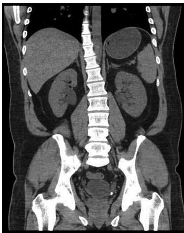
Figure 1: Stone in ureter with hydronephrosis

Urolithiasis is a common disease, with prevalence ranging from 1% to 20%. [6] In a regional middle eastern study, the prevalence of urinary calculi according to ethnic origin in descending order of frequency was Egyptians (29.5%), Pakistani (24.9%), Indian (23.3%), Yemeni (20.5%),