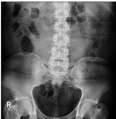
Figure 3: Stone moved to left kidney