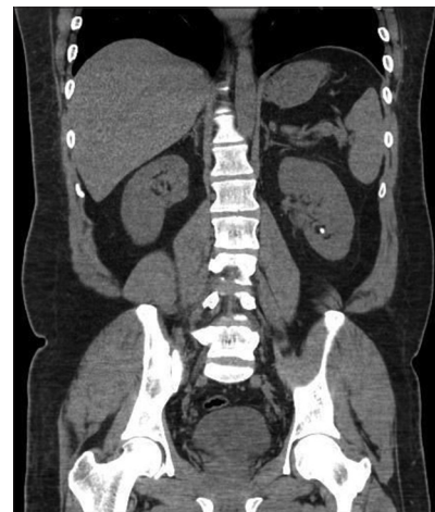
Figure 4: Stone moved to left kidney with resolution of hydronephrosis