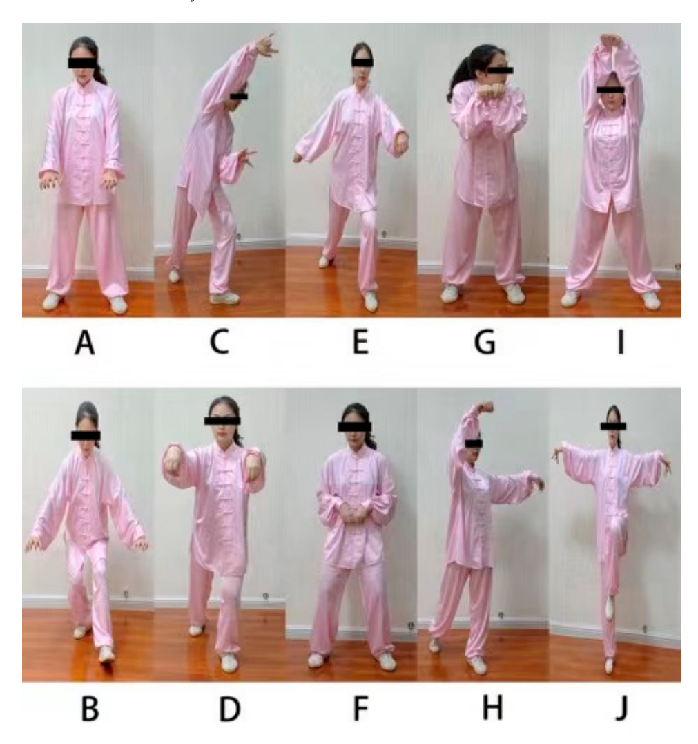
Figure 1. Ten forms of Wuqinxi Qigong. (A) . Form 1: Raising the tiger's paws; (B) . Form 2: Seizing the prey; (C) . Form 3: Colliding with the antlers; (D) . Form 4: Running like a deer; (E) . Form 5: Rotating the waist like a bear; (F) . Form 6: Swaying like a bear; (G) . Form 7: Lifting the monkey's paws; (H) . Form 8: Picking fruit; (I) . Form 9: Stretching upward; (J) . Form 10: Flying like a bird.

instructor gave instructions and demonstrations, requiring participants to count or recite each form of Wuqinxi while practicing, as well as focus on maintaining balance, posture and action consistency.