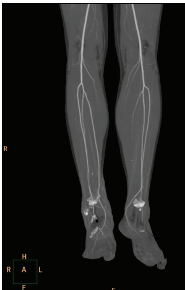
Figure 3. Computed tomography angiography of the lower limbs showed the filling defects of the bilateral distal posterior tibial arteries over the level of the ankles. The toes had collateral circulation from fibular arteries.

tunately, there is no accurately defined treatment. [2] DMARDs, including mycophenolic acid, were administered for 2 months, but the wound healing response was very poor. Although mycophenolic acid might play a role in the treatment of anti-