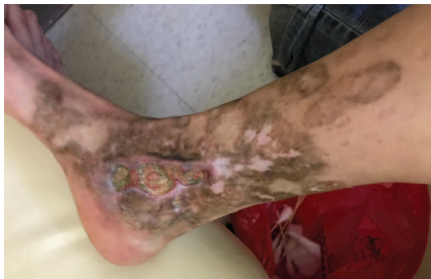
Figure 4. The wounds only partially healed after 2 doses of monthly omalizumab (300 mg) and disease-modifying anti-rheumatic drugs (DMARDs). We stopped mycophenolic acid and hydroxychloroquine because of onychomadesis before the third dose of omalizumab.

tunately, there is no accurately defined treatment. [2] DMARDs, including mycophenolic acid, were administered for 2 months, but the wound healing response was very poor. Although mycophenolic acid might play a role in the treatment of anti-