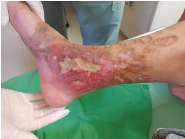
Figure 1. Multiple unhealed ulcerations on the bilateral ankles persisting for 6 months.