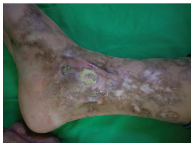
Figure 5. The patient received only omalizumab and colchicine for the subsequent 5 months, and the wounds showed almost complete healing.

neutrophil cytoplasm antibody-associated systemic vasculitis, [6] we consider the mycophenolic acid therapy in our patient to be unsuccessful. The wounds continued to heal without mycophenolic acid post third dose of omalizumab, which indicated that the patient did not respond to mycophenolic acid.