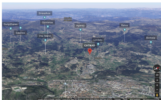
Figure 2 Satellite 3D image of the 9 different sampling locations in relation to the CHTMAD hospital centre in Vila Real, Portugal.

collected from different points of each corresponding drinking trough and cowshed, respectively. Swabs were collected into Stuart transport media; water was recovered into 500 mL PET flasks with 60 mg/L sodium thiosulphate and soil was gathered into appropriate zipper seal sample bags. Samples were processed in the same day or stored at 4°C for a maximum of 24 h. Swabs and soil samples were incubated into Brain Heart Infusion broth with 6.5% (w/v) NaCl for 48 h at 37°C and after seeded on Oxacillin Resistance Screening Agar Base (ORSAB) supplemented with 2 mg/L oxacillin. Water samples were filtered through 47 mm 0.2 µm filters that were further placed on ORSAB plates with 2 mg/L oxacillin. All plates were incubated for 24 to 48 h at 37°C and after screened for presumptive