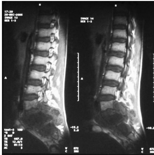
Figure 1. Sagittal view MRI scan of lower vertebral column