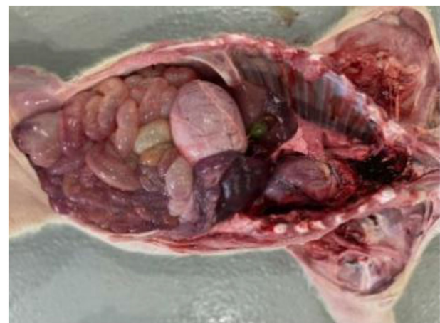
FIGURE 2 Septicaemia caused by Escherichia coli . Lesions of pig infected with E. coli F18. Note reddened, gaseous intestinal tract

Abbreviation: MCFA, medium chain fatty acids (free fatty acids).