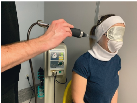
FIGURE 2: Local cryotherapy procedure in the TMJ area.

values before and after the therapy. In addition, McNemar's chi-square test was used to analyse the nominal data. The results were considered statistically significant at p < 0.05 . For calculations, R package was selected.