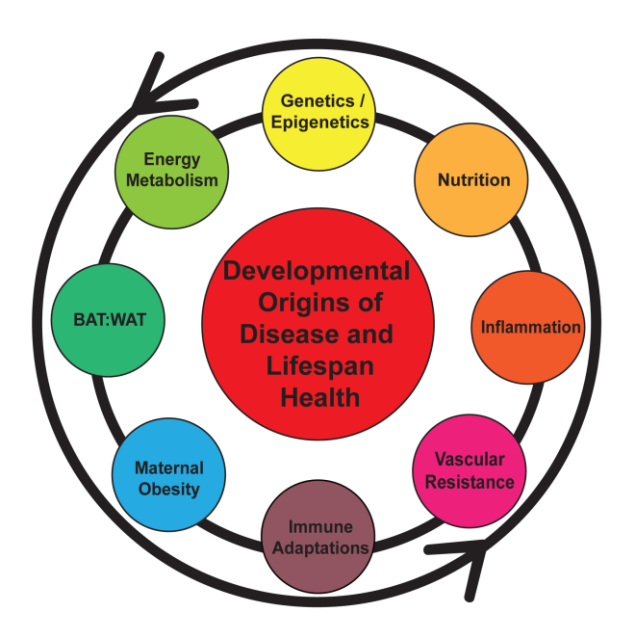
Figure 1. Early programming can be initiated by a number of maternal and fetal factors that sets the stage for a lifetime of health or disease. BAT, brown adipose tissue; WAT, white adipose tissue.