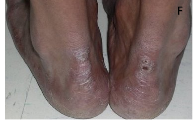
Fig. 2. Skin manifestations of Mycobacterium leprae infection. D) Annular ulcerated plaques over the left knee. E) Hyper-pigmented nodular lesions of the dorsal aspect of the feet. F) Hyper-pigmented plaques of the posterior heel bilaterally with crusted ulcerative lesion on the right side.