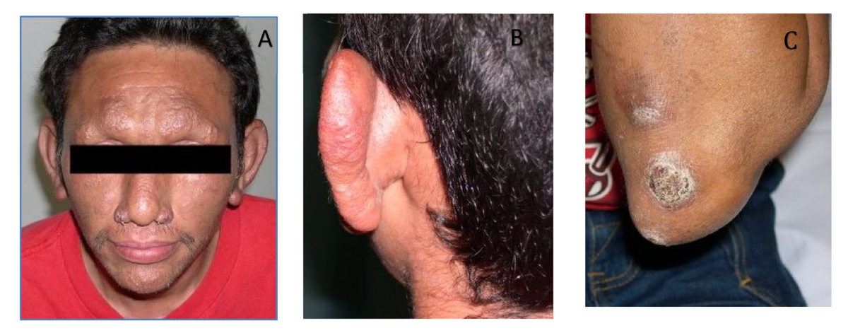
Fig. 1. Skin manifestations of Mycobacterium leprae infection. A) Leonine facies with madarosis (complete loss of eyebrows) and bilateral nodular lesions of nasal ala. B) Left ear nodularity. C) Crusted ulcerative lesions of the left elbow.

Case 1, had multiple risk factors that need to be considered when suspecting leprosy infection, including the patient's Mexican origin, exposure to an inmate with similar skin lesions during incarceration, and history of exposure to an infected relative. Prior studies considered lepromatous leprosy as a travel-related hazard