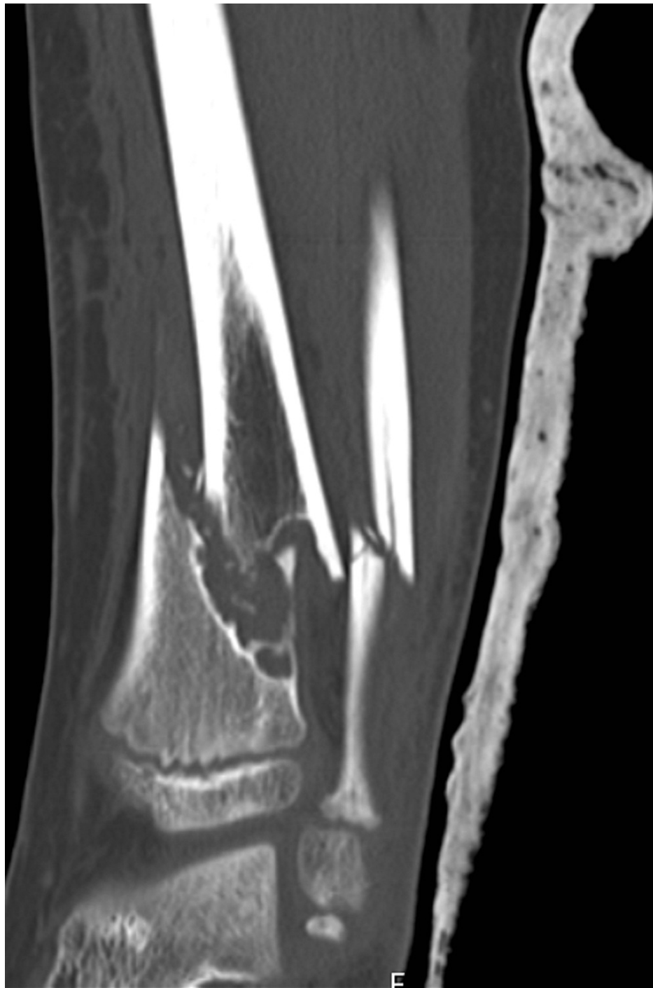
FIGURE 5: Coronal CT view of the left tibia and fibula

The patient later underwent an open reduction internal fixation (ORIF) of his distal tibia and fibula. Plate osteosynthesis was carried out using a distal tibial and fibular plate with synthetic bone grafting. This was a 100-degree tubular fibular five-hole plate with four cortical screws. The lesion was curetted out and a 5 cc (5 ml) Cerament bone void filler was used to fill the void. This was then fixed with a 3.5 mm compression locking six-hole plate where four cortical locking screws were used. Two screws were placed in the tibia. A good and acceptable reduction was achieved, and check X-rays were performed (Figure 6). The wound was closed with polyglactin and poliglecaprone. The growth plate was protected throughout the procedure. Samples from surgery sent for histology showed some necrotic tissue, small fragments of bone, granulation tissue and blood clots, but no evidence of a malignancy.