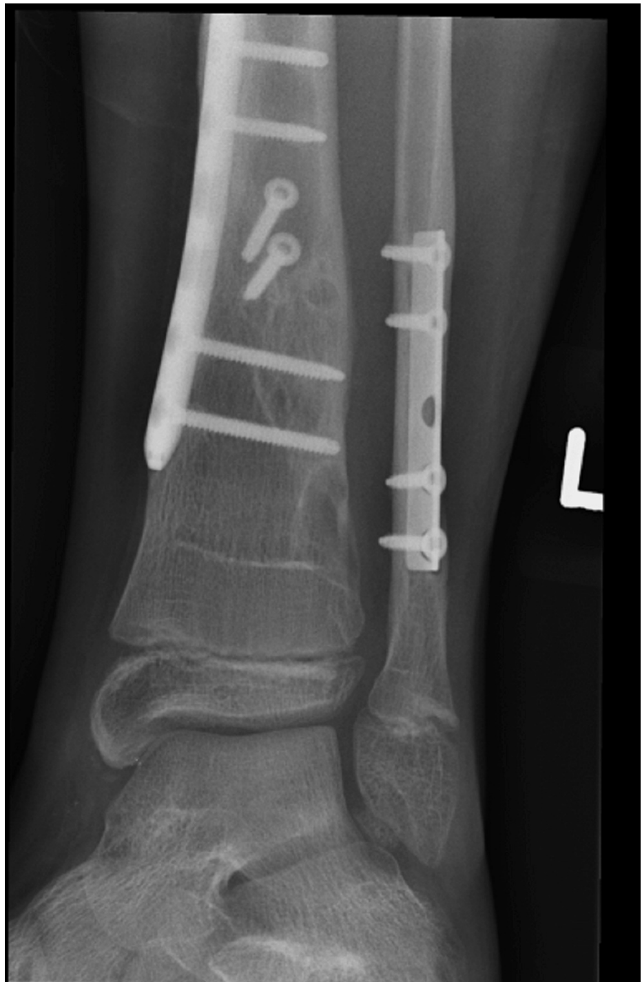
FIGURE 12: AP view of the left tibia and fibula