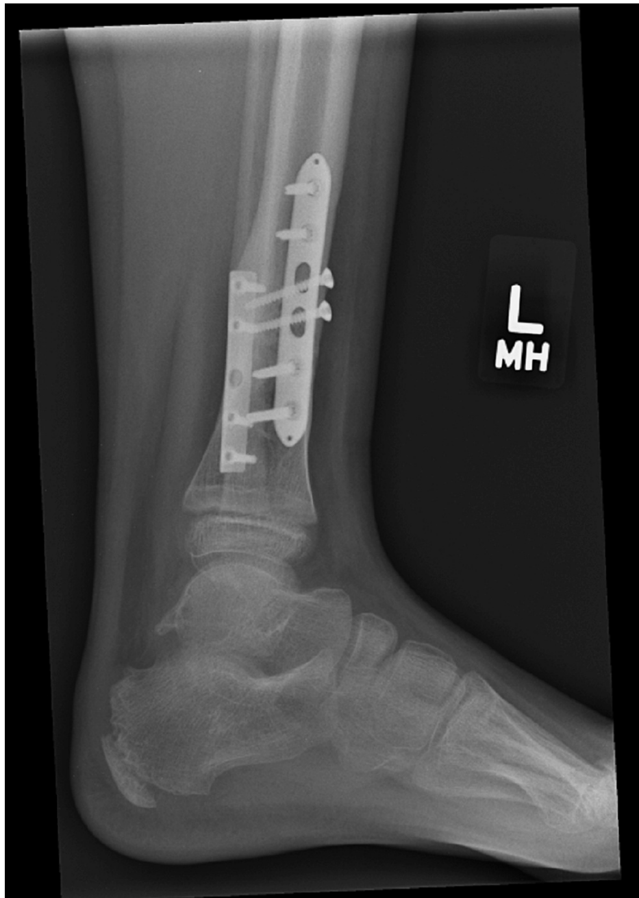
FIGURE 11: Lateral view of the left tibia and fibula

Further X-rays done upon arrival in the clinic 18 months post-op showed full consolidation of the cyst. The fracture had fully healed with no issues at the wound site (Figure 12, 13).