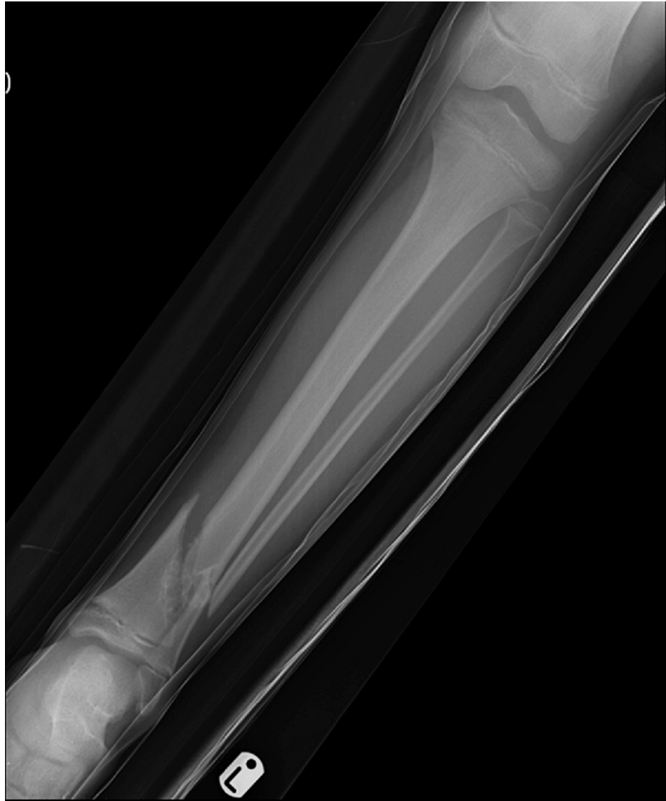
FIGURE 1: Anteroposterior (AP) view of the left tibia and fibula