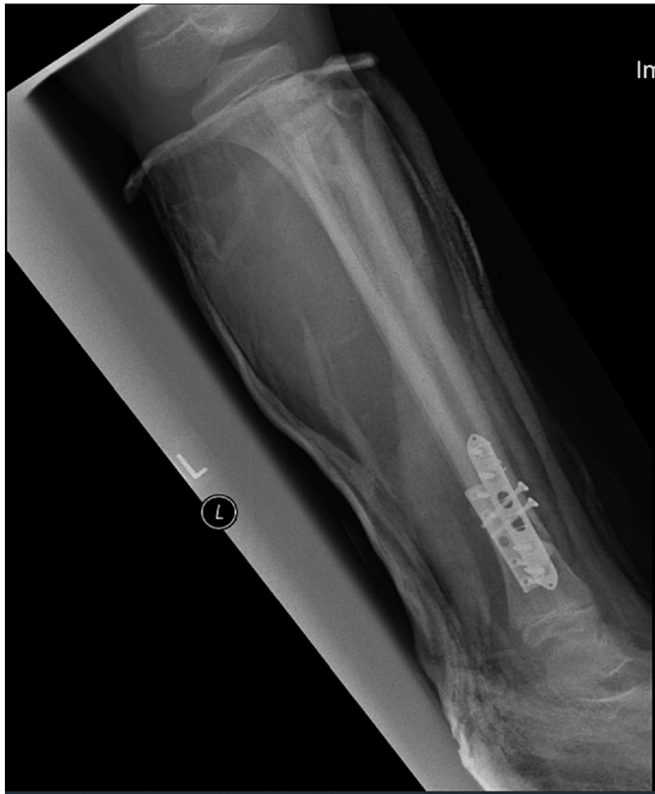
FIGURE 8: Lateral view of the left tibia and fibula post-surgery in a below-knee cast

He was later discharged from the hospital following surgery and was followed up in the clinic. He was managed in a below knee non-weight bearing cast for nine weeks. At this point, he was placed in a below-knee lightweight cast and allowed to partially weight bear. He was then moved to a moon boot and allowed to partially weight bear through this at 14 weeks post-surgery.