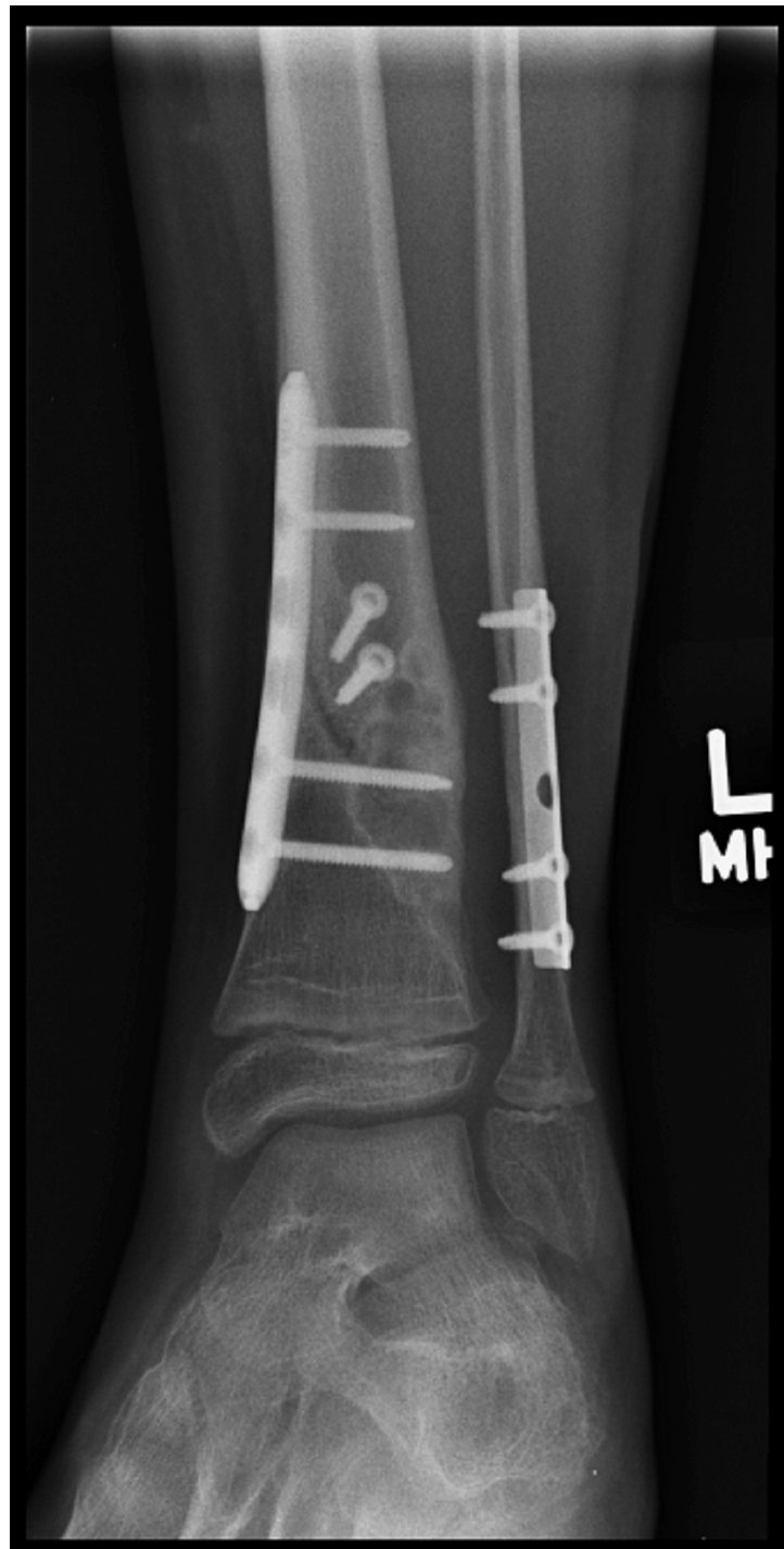
FIGURE 10: AP view of the left tibia and fibula