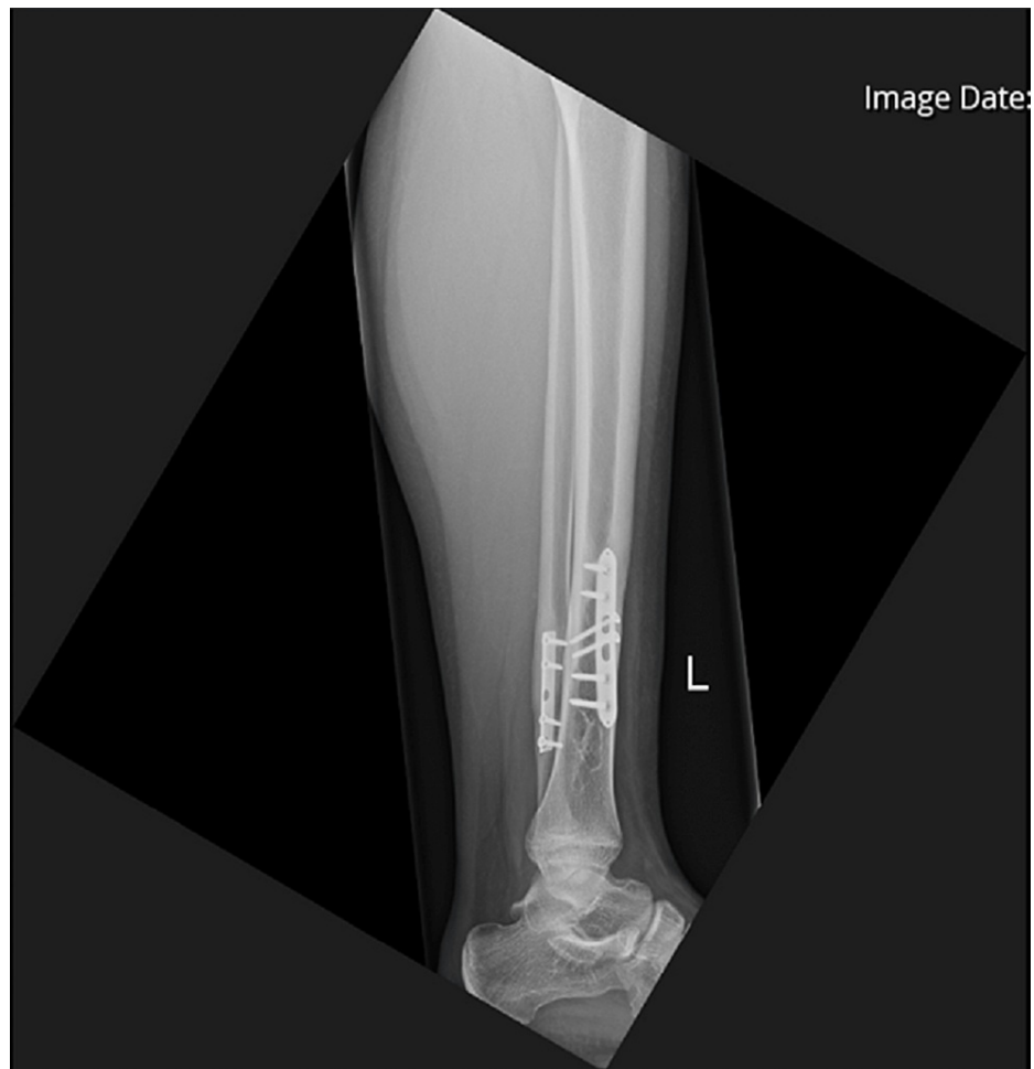
FIGURE 15: Lateral view of the left tibia and fibula