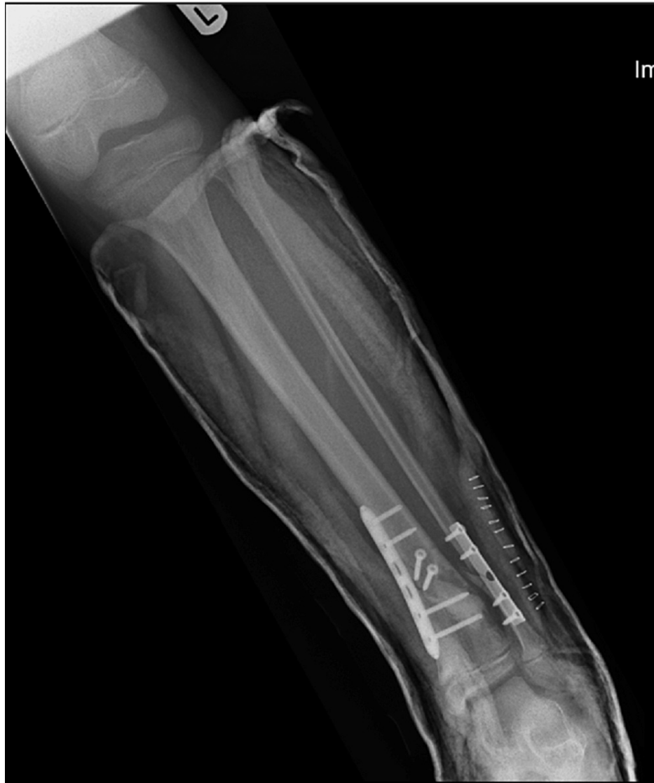
FIGURE 7: AP view of the left tibia and fibula post-surgery in a below-knee cast