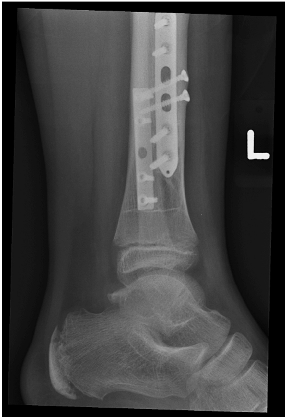
FIGURE 13: Lateral view of the left tibia and fibula

He was referred to the clinic six years after his initial injury for consideration of plate removal. He complained of occasional swelling and pain around his previous fixation site but denied daily pain. X-rays done at this point showed that the plates had been incorporated by the bones (Figures 14, 15). Due to the relative risk and benefit ratio, the decision was made to not remove the plate.