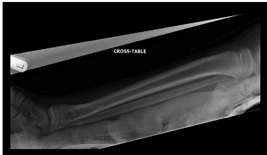
FIGURE 4: Lateral view of the left tibia and fibula post-backslab

He later underwent a computed tomography (CT) scan which confirmed the previous findings of a pathological closed oblique fracture through a primary bone lesion involving the distal one-third diaphysis of the tibia with an associated oblique fracture of the fibula (Figure 5). The distal fracture fragments were anteriorly displaced with overlying soft tissue swelling. The joints above and below were intact. The primary bone lesion was eccentric, and juxta cortically based, lucent with a bubbly lobular outline most in keeping with a non-ossifying fibroma. In conclusion, it demonstrated a pathological distal third tibia and fibula fracture through a non-ossifying fibroma.