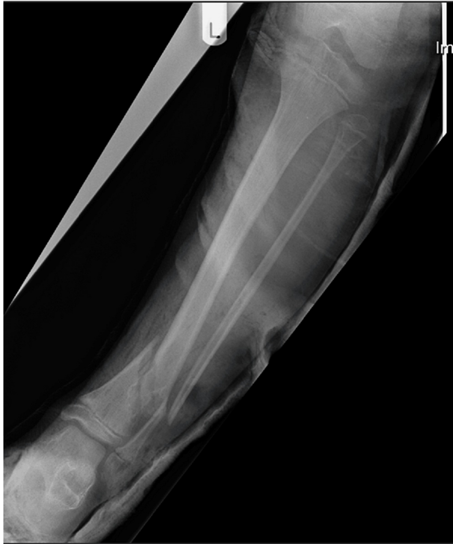
FIGURE 3: AP view of the left tibia and fibula post-backslab