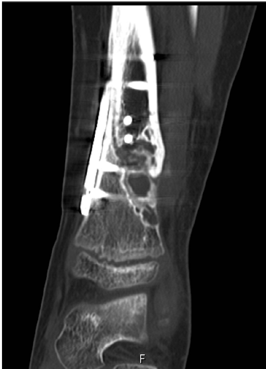
FIGURE 9: Coronal CT view of the left tibia and fibula

At 24 weeks post-op, he was fully weight-bearing with no pain and had a full range of movement in the left ankle. X-rays done at that point showed further progression of healing (Figures 10, 11). He was then allowed to fully weight bear and only advised to wear the moon boot outdoors.