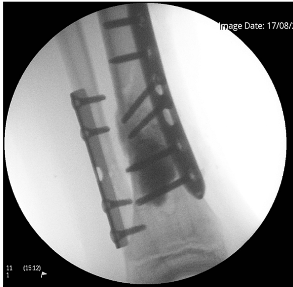
FIGURE 6: Fluoroscopy image from left tibia and fibula ORIF