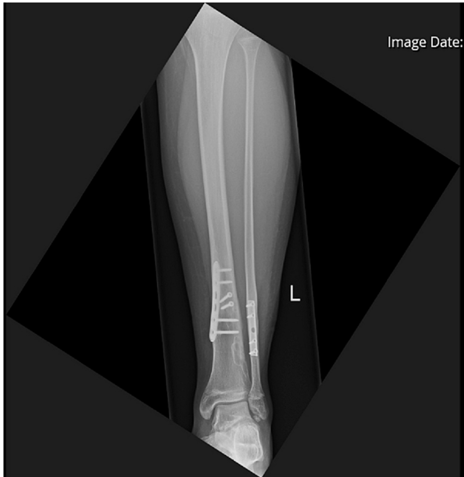
FIGURE 14: AP view of the left tibia and fibula