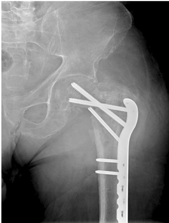
Figure 1 Anterior-posterior radiograph of the left hip. This shows a proximal femoral locking plate in good position with moth-eaten appearance of proximal femur and surrounding lysis that could be suggestive of infection or malignancy.

generalized soft tissue swelling of the left thigh with no signs of hardware failure. Computed tomography (CT) scanning of the pelvis and left thigh was suggestive of the diagnosis of a psoas abscess (Figure 2A, B).