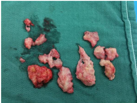
Figure 3 Intra-operative specimen. These samples were taken at the time of initial incision and drainage. Cultures were negative while pathology came back positive for B-cell lymphoma.

results were available. Two weeks later, final pathology reports supported the diagnosis of a diffuse large B-cell lymphoma. Anti-tuberculosis drugs were discontinued and a medical oncologist was consulted to initiate chemotherapy.