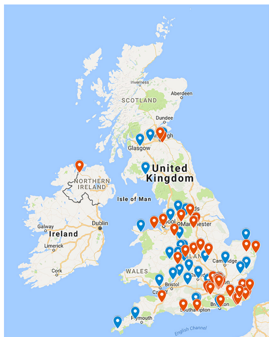
Figure 4 UK Singing for Lung Health groups: the blue points on the map represent groups run by a BLF trained leader. Red points on the map are groups run by non-BLF-affiliated groups. Eleven of these groups are affiliated with Breathe Easy groups. Courtesy of the British Lung Foundation (map data ©2017 GeoBasis-DE/BKG (©2009), Google).

groups at the time of the evaluation. The experience of other BLF leaders in the other groups and groups led by those without any specific training may be different. However, it was agreed by AL and PC that data saturation was reached due to no new themes emerging from the final interviews. This was supported by a review of the data by a singing leader who received the BLF training but was not interviewed and a singing group member. Transcripts were not returned to participants.