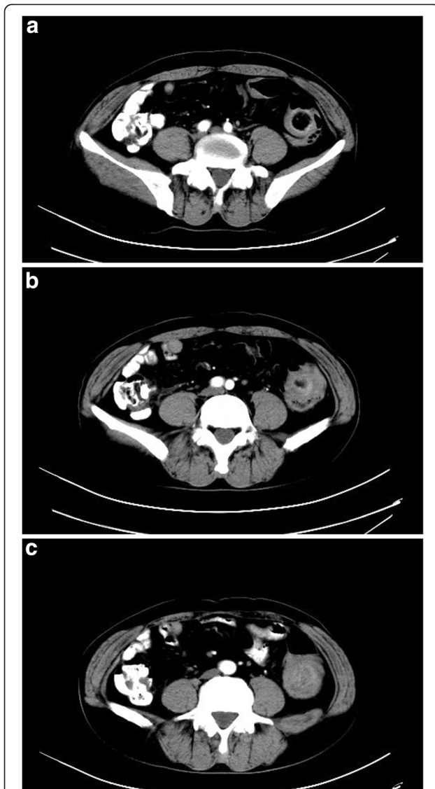
Figure 2 Abdominal CT scan with contrast from (a) to (c) showed a 5 cm diameter mass-like lesion at the junction of the descending and sigmoid colon with significantly thickened walls with dilated lumen. There were multiple rings within the mass with smooth margins suggesting colon intussusception. CT, computed tomography.

confirmed with surgical pathology. However, the overall pre-operative diagnostic accuracy for gastrointestinal angiolipomas is quite low due to the non-specific clinical presentations and lack of specific findings on imaging studies. Error in diagnosis can lead to inappropriate surgery such as an unnecessary radical resection because of an erroneous preoperative diagnosis of colon cancer. The correct diagnosis of gastrointestinal angiolipomas is usually made intraoperatively and confirmed by final surgical pathology. When possible, an intraoperative biopsy with frozen section may provide an accurate diagnosis to guide surgery. In our case, preoperative biopsy