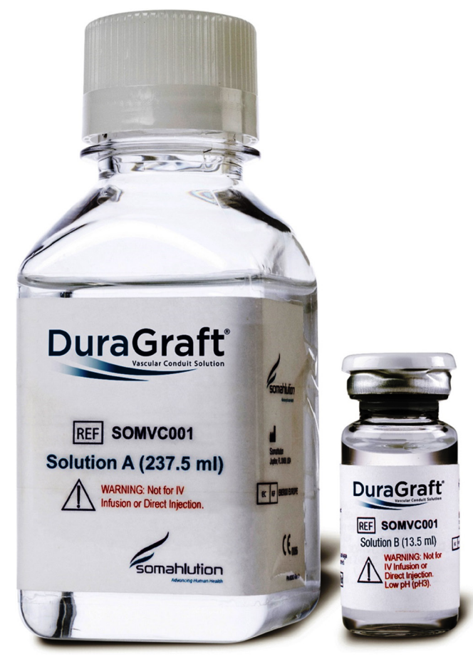
Figure 1 DuraGraft treatment solution.

will be conducted on all patients who withdraw or who are discontinued from the study.