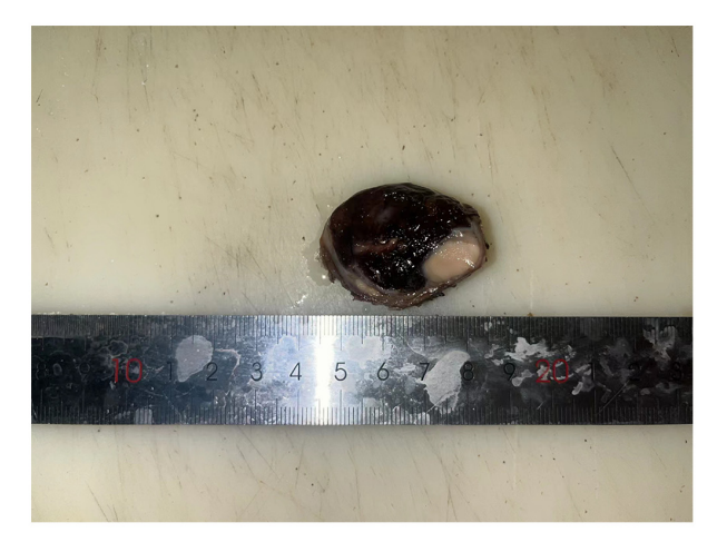
Figure 2. Macroscopic tumor image. Tumor components exhibited clear boundaries and were wrapped together in a distinct capsule.

knowledge, based on a thorough literature search of PubMed (www.pubmed.gov; search terms: Liver collision or hepatocellular collision or hepatocellular carcinoma concomitant), the only previously published case report of an HCC-CH collision tumor in the liver was reported by Ge et al (10) (Table I).