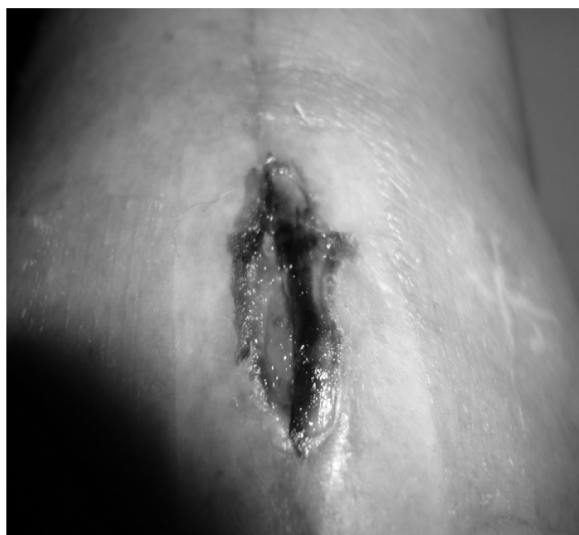
Figure 1 Photograph taken before starting the therapy.

On admission, the patient was found to have a wound in a persistent inflammatory condition and with pus secretion (Figure 1). Also on admission, in addition to the