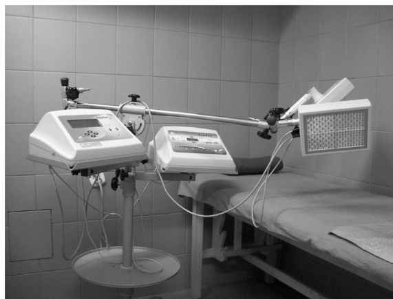
Figure 2 Apparatus Viofor JPS Standard to magnetoledtherapy procedures.

The magnetic field intensity amounted to 6. The procedures were performed in outpatient mode, two times a day, daily, for 3 weeks. After each procedure, the wound was dressed in a protective dressing.