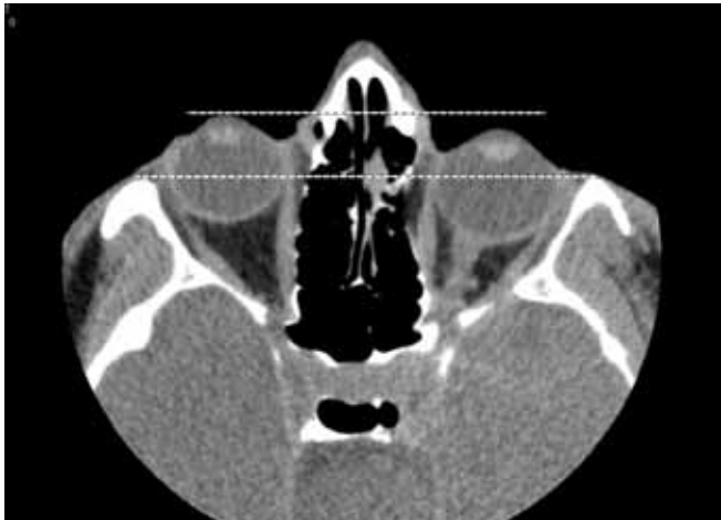
Fig. (1c). In contrast to the clinical picture, this Axial CT scan image, performed during an inadvertent Valsalva manoeuvre, shows only minimal left enophthalmos (highlighted by the broken lines).

The disparity between the globe position on CT and the last clinic visit necessitated a repeat assessment. This was essential to exclude a new change prior to embarking on surgical implantation of a high density porous polyethylene (Medpor®) enophthalmic wedge implant, in order to augment his orbital volume and increase the anterior projection of his globe into a more aesthetic position.