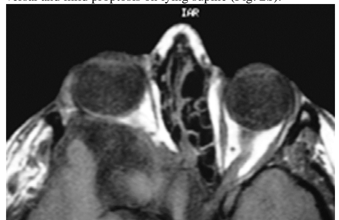
Fig. (2c). T1 weighted MRI scan showing right sided herniation of brain contents through the orbital bony structural abnormality with proptosis of the globe.

Fig. (2a) shows marked right sided enophthalmos in the sitting position, as demonstrated by the right globe distance from a horizontal line drawn from the left cornea, with reversal and mild proptosis on lying supine (Fig. 2b).