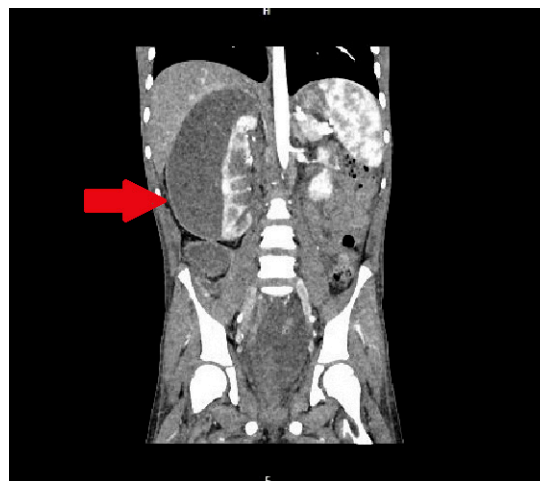
Figure 2. The lesion of unknown character in the area of the right kidney, shown in the frontal plane of the CT scan. The lesion is marked by an arrow.