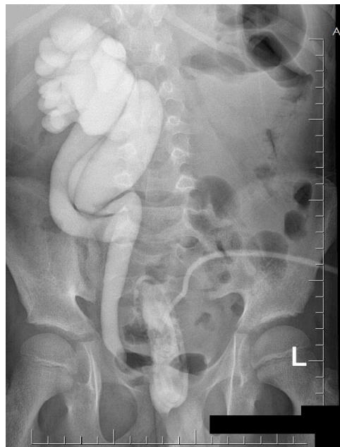
Figure 3. The duplicated collecting system and the fifth-degree vesicoureteral reflux on the right side were presented in the micturating cystourethrography.

The patient was transferred to the nephrology clinic for further treatment.