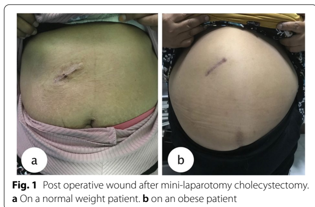
Fig. 1 Post operative wound after mini-laparotomy cholecystectomy. a On a normal weight patient. b on an obese patient

This study has been approved by the Institutional Review Board of the Faculty of Medicine, Public Health and Nursing, Universitas Gadjah Mada and Dr. Sardjito Central Hospital, Yogyakarta, Indonesia (KE/FK/0796/