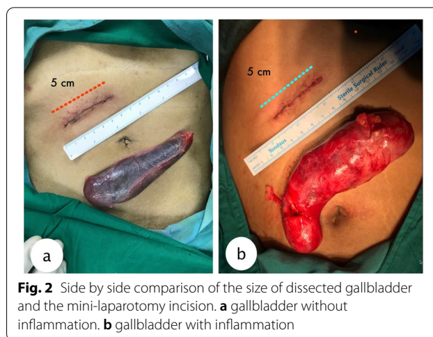
Fig. 2 Side by side comparison of the size of dissected gallbladder and the mini-laparotomy incision. a gallbladder without inflammation. b gallbladder with inflammation

Indonesia is a developing country where the government had just recently imposed a national health insurance and thus creating a price ceiling for each medical treatment. This situation put an inclination for