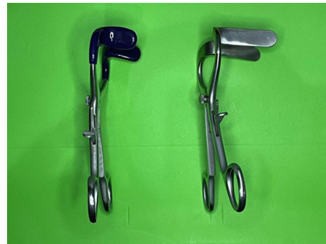
Fig. 4 (left) Unmodified dental mouth gag. (right) Modified dental mouth gag used for mini laparotomy cholecystectomy

Surgical instruments used in MLC are mostly affordable. However, these instruments came in inadequate length resulting in difficulty in some cases, especially in obese patients, when the blade or tip is insufficient to properly retract the skin and subcutaneous tissue [12, 13]. Therefore, we modified few tools to suit the MLC procedures better during the period of this study. Modifications of size and thickness of the tools are needed to ease the visualization and prevent instrumental damage in MLC procedure, especially in obese patients. For example, a Molt dental mouth gag that can be commonly found (Figs. 3.a1, 4) was modified so that the prong tip is longer to reach all abdominal layer, therefore allowing the mouth gag to become a surgical retractor for the small incision. Another tool that has been modified is the Langenbeck retractor (Fig. 3.a2). The retractor is modified