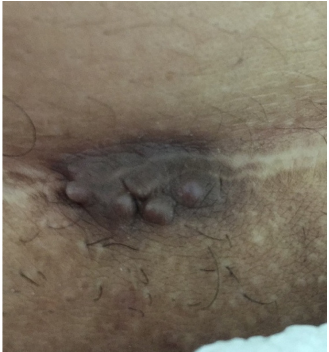
FIGURE 1: Endometrioma measuring 2 cm x 3 cm located on the lateral aspect of the Pfannenstiel incision with tiny multiple orifices protruding on the skin

A physical examination revealed a palpable, tender, subcutaneous mass, measuring 2x3 cm, located on the lateral aspect of the Pfannenstiel incision, with multiple tiny orifices protruding on the skin (Figure 1).