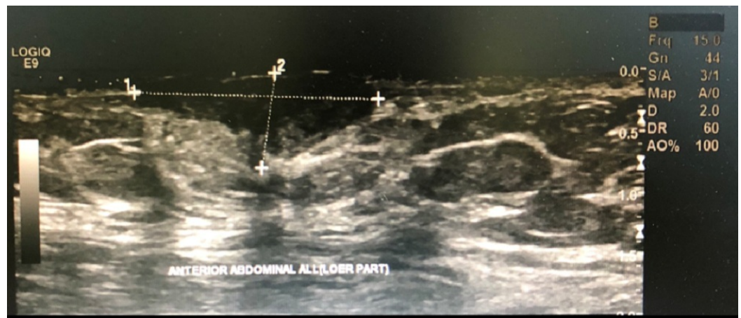
FIGURE 2: Abdominal wall soft tissue revealed a heterogeneous hypoechoic mass with few vasculatures

A wide local excision of the skin lesion with the underlying subcutaneous tissue, measuring 4.1x5.2 cm, found multiple, minute, firm hemorrhagic foci. Histopathology was performed and revealed a benign endometrial gland and stroma in the tissues, confirming the diagnosis of endometriosis (Figure 3).