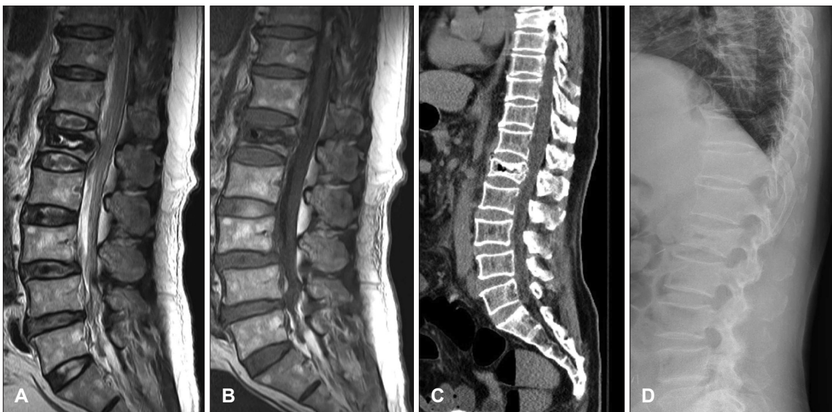
FIGURE 1. Magnetic resonance image (MRI) of Kümmell's disease. MRI of the lumbar spine shows a well-defined fluid signal intensity lesion surrounding dark rim with at L1 vertebral body. (A) Sagittal T2-weighted image (WI) showing band-like gas in the vertebral body. (B) Sagittal T1-WI showing a band-like low intensity signal. (C) Sagittal computed tomography image showing a recent compression fracture with retropulsion, and L1 intravertebral fluid and air-densities. (D) Sagittal X-ray image showing intravertebral gas cleft at L1.

VAS scores are summarized in Table 1. Back pain, as measured on the VAS, was statistically significantly reduced after PVP. Mean ( \pm standard deviation) VAS scores preop-