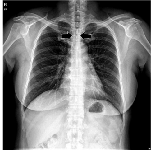
Figure 1. Preoperative chest X-ray shows tracheal stenosis.

Routine monitoring equipment, including an electrocardiogram, a pulse oximetry device, and a noninvasive blood pressure monitor, were attached to the patient. After preoxygenation with 100% oxygen, general anesthesia was induced using a