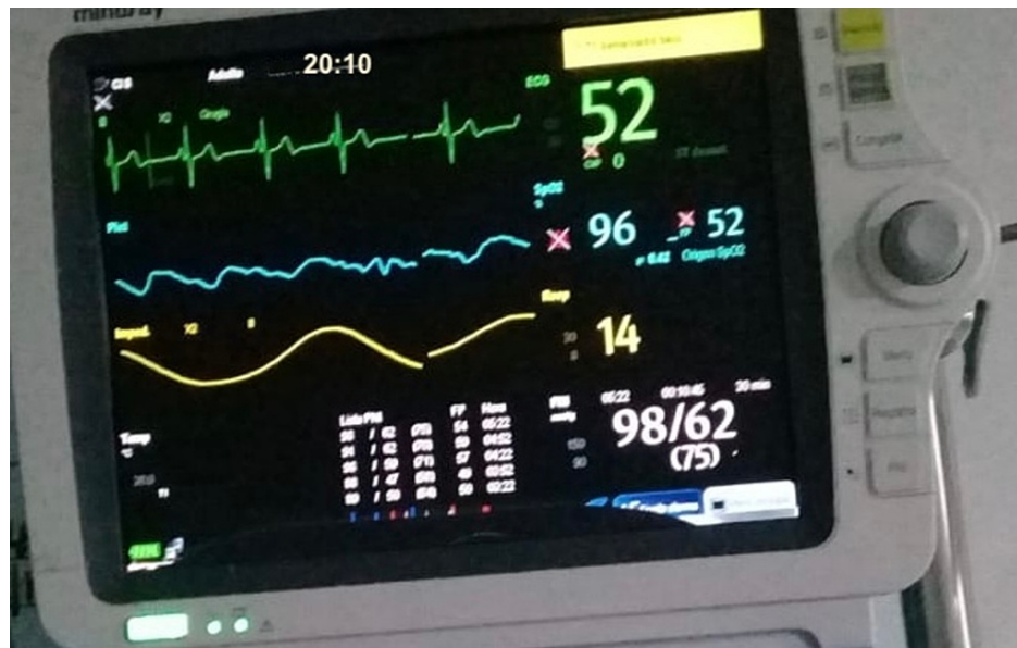
FIGURE 2: Bradycardia