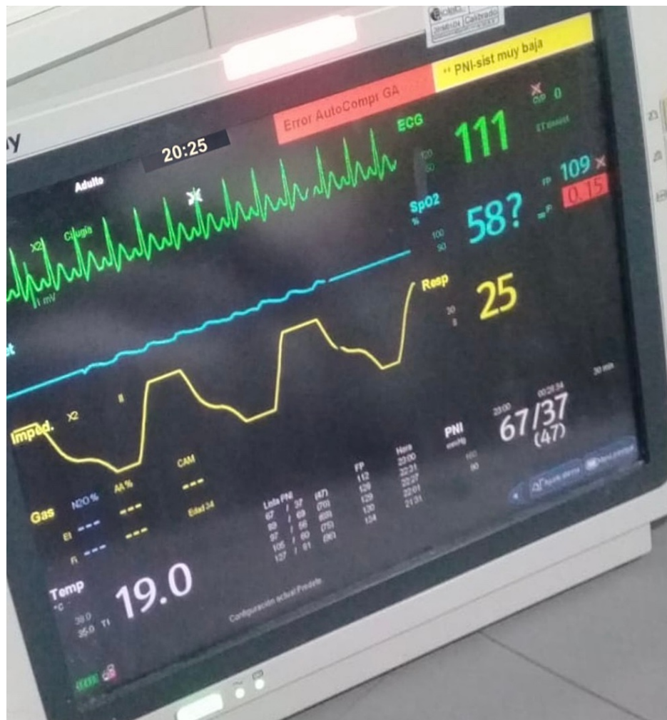
FIGURE 3: Return of spontaneous circulation