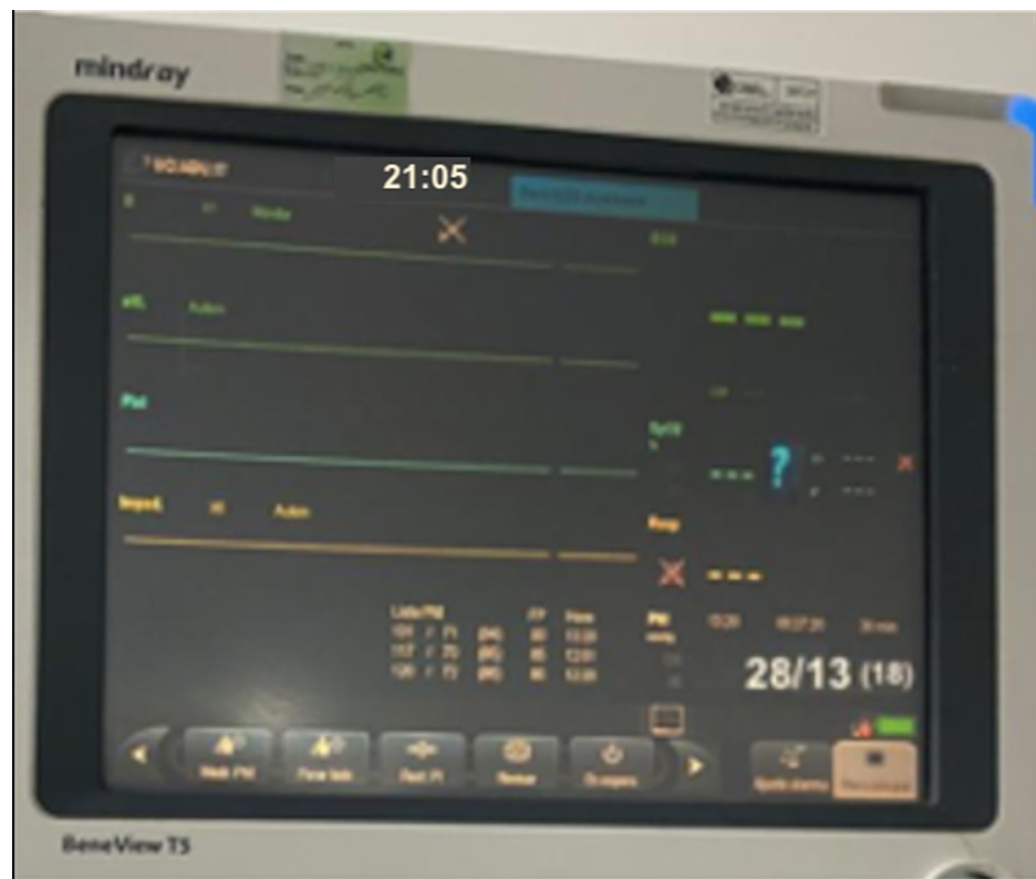
FIGURE 4: Asystole

According to the guidelines of the Colombian Ministry of Health regarding the handling of corpses due to the COVID-19 pandemic, it is established that the corpse must be kept intact and limit its manipulation, without removing catheters, probes, or tubes that may contain the fluids from the corpse [5]. The patient continued with vascular accesses, orotracheal tube, and urinary catheter. Twenty minutes after the death was declared, while waiting for the sheets to be shrouded and cotton to cover the natural orifices, the patient spontaneously recovered her pulse and respiration, evidenced by thoracic expansion; nevertheless, regaining of consciousness was not confirmed. The monitors were connected showing a heart rate of 92bpm, blood pressure 154/85mmHg, oxygen saturation 94% with adequate coupling to the ventilator (Figure 5), pupils responded to light. Blood samples were requested, arterial blood gas analysis and post-cardiac arrest care were started. Finally, she died 21 days later from multiple organ dysfunction syndrome septic shock because of viral pneumonia confirmed by COVID-19.