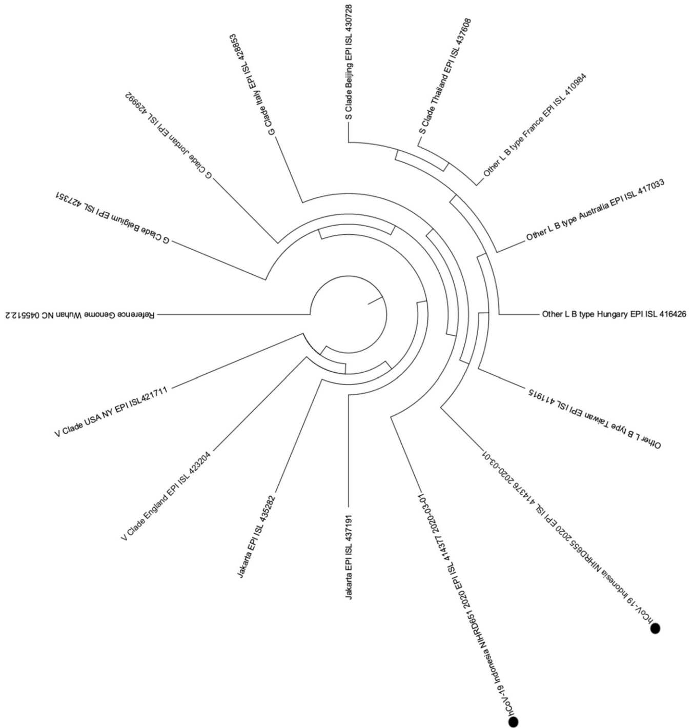
FIGURE 3. Neighbor-joining phylogenetic tree for two samples from the first cluster in Indonesia (indicated with solid circles). The phylogenetic analysis was performed based on 387 bp of the partial N region. The nucleotide sequences obtained from direct sequencing and the reference sequences retrieved from the GISAID database were aligned with Clustal X software ( http://clustal.org/clustal2/ ). The evolutionary distances were computed using the maximum composite likelihood method. The analyses were performed using Molecular Evolutionary Genetics Analysis software version 7 ( https://www.megasoftware.net/ ).

infection, increased access to testing, isolation of cases, and intensive contact investigation.