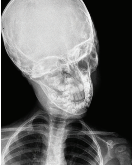
FIGURE 1: Cock-robin position on anterior-posterior direct cervicography.