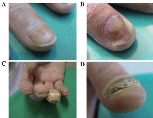
Figure 1. Representative images of nail alterations. (A) Dark pigmentation of fingernails (level 1); (B) onycholysis of fingernails (level 2); (C and D) subungual hyperkeratosis in fingernails (level 3).