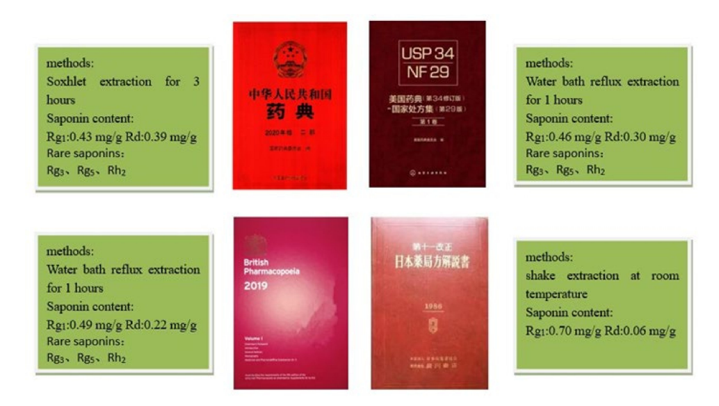
Figure 2. The different pretreatment methods in China Pharmacopoeia, Japan/Korea Pharmacopoeia, the United States Pharmacopoeia, and European Pharmacopoeia on ginsenosides.