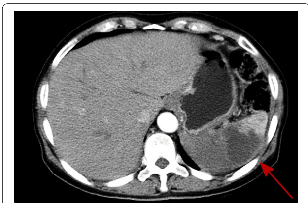
Fig. 1 Abdominal computed tomography (CT) imaging revealed patchy hypodense shadow of the spleen with wedge-shaped changes

no history of autoimmune diseases or long-term use of immunosuppressive drugs such as glucocorticoids. Physical examination showed tenderness in left upper abdomen, flat and soft abdomen, no gastrointestinal type and peristaltic wave, no varicose veins in the abdominal wall, no rebound tenderness, and no palpable liver and spleen. Laboratory analyses revealed that her blood glucose level was 32.83 mmol/L, C-reactive protein was 45.683 mg/L, HbA1c was 14.43%, urinary ketone bodies (++) , and coagulation function tests reported the following: fibrinogen level 6.36 g/L, activated partial thromboplastin time 22.50 s, D-dimer level 2.28 mg/L, and fibrin degradation products 6.10 mg/L. Arterial blood gas analysis revealed a state of metabolic acidosis: pH 6.80, partial pressure of carbon dioxide in arterial blood ( \text{PaCO}_2 ) < 10 mmHg, bicarbonate ( \text{HCO}_3^- ) < 10 mmol/L, and base excess - 33.8. Laboratory findings suggested hyperglycaemia with glycosuria and ketoacidosis. An abdominal computed tomography (CT) imaging revealed a patchy hypodense shadow of the spleen with wedge-shaped changes (Fig. 1). After admission, the patient was diagnosed as having diabetic ketoacidosis combined with spleen infarction, which was life-threatening, based on clinical characteristics and auxiliary examination.