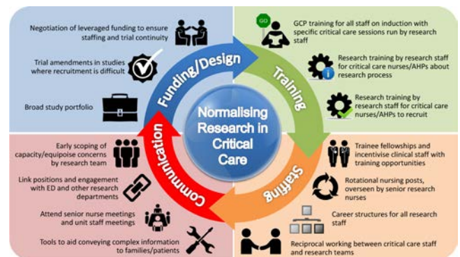
Figure 1 Normalising research. AHP, Allied Health Professional; ED, emergency department; GCP, Good Clinical Practice.

This theme related to the organisational system in which units were situated, and incorporated Trust or Board