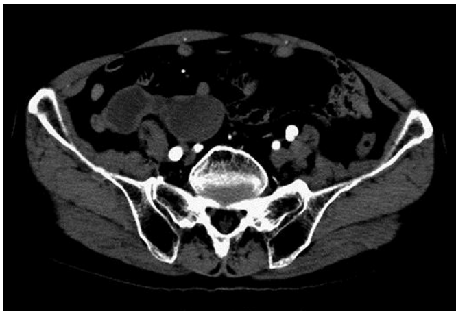
Fig. 2. Abdominal CT showed dumbbell-like encapsulated cystic lesion at the cecum.