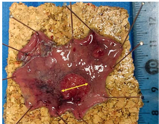
► Fig. 2 Adenocarcinoma with submucosal invasion over 2500 microns measuring 11 × 10 mm.

large investment in electronic chromoendoscopy technology, on one hand, and on the other, the development of accurate classifications. It could be argued that no classification is 100% accurate, and its false-negative/-positive results could lead to under-treatment/overtreatment. However, while it may be difficult to identify a deeply invasive malignant area within a lesion (i. e., NICE 3 sensitivity of only 63% [5]), it is extremely rare to misdiagnose a deeply invasive lesion as a noninvasive benign lesion (NICE 3 specificity >96% [6]) even by non-expert gastroenterologists [7]. What are the main barriers preventing the replacement of size with optical diagnosis? First, there was a lack of structured training for optical diagnosis in the Western setting. Only recently, ESGE developed a curriculum for optical diagnosis that includes the endoscopic prediction of deeply invasive cancer. Second, the main purpose of optical diagnosis for complex polyps is in orienting advanced techniques in resec-