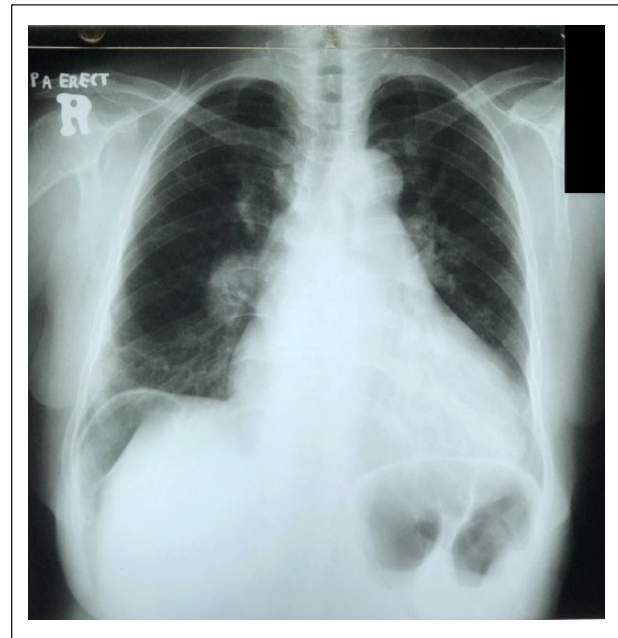
Figure 1. First chest radiograph upon presentation to the Emergency Department. This chest radiograph showed the presence of air under the right hemi-diaphragm and also slight right lower zone infiltrates.

Chilaiditi's sign is the presence of air under the right hemi-diaphragm with the appearance of haustral folds indicating confinement of gas within the bowel. 1,3 It represents an asymptomatic colonic interposition between the liver and right hemi-diaphragm. 4–6 Initially reported by Demetrius Chilaiditi in 1910, it is a cause of the appearance of pseudo-pneumoperitoneum on the chest radiograph. 6,7 The cause of the signs appearance is poorly understood. Ordinarily, colonic fixation and suspensory ligaments prevent interposition of the colon between the diaphragm and liver. 4 Therefore, Chilaiditi sign could be