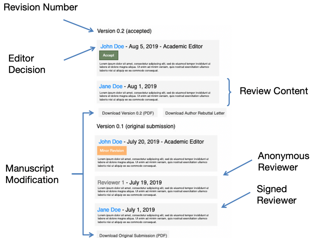
Figure 1 The structure of the PeerJ open review audit histories, with labeled areas of interest.