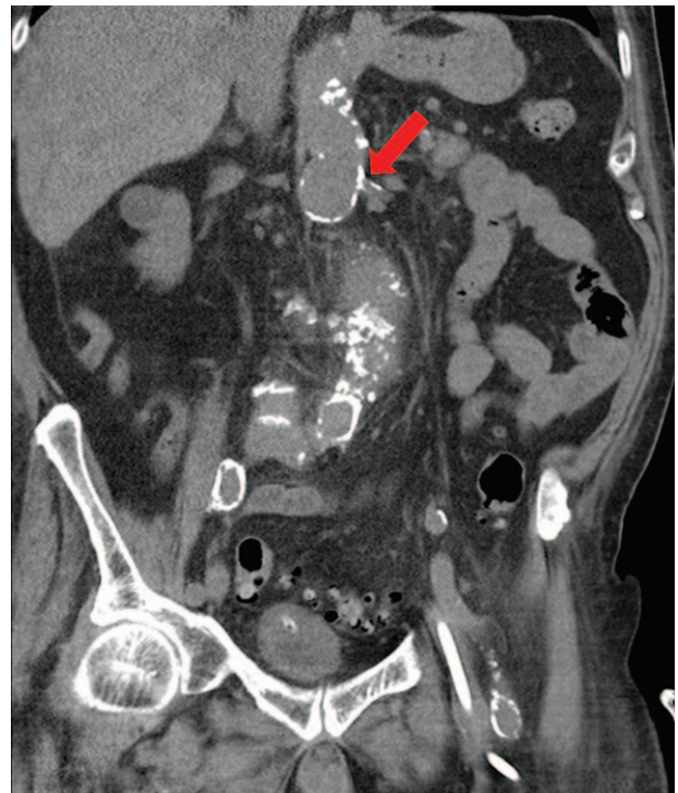
Figure 3. Computed tomography of the abdomen without contrast agent. Arrow points toward the calcified exit of the left renal artery.

Aortic aneurysms are enlargements of the aorta, mostly located in the abdominal aorta. Known risk factors of AAA are age, male sex, smoking, arterial hypertension, and hypercholesterolemia. [2] AAA are usually asymptomatic but if they increase in size, they can cause abdominal pain and back pain as well. Nevertheless, the complications of aortic aneurysms are feared, especially the rupture which results often in a massive bleeding with