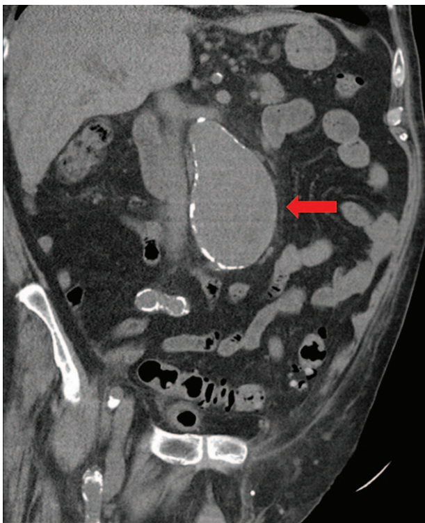
Figure 1. Computed tomography of the abdomen without contrast agent. Arrow points toward the infra-renal aortic aneurysm.

care unit for further observation. Due to the persistent anticoagulative effect of dabigatran caused by the renal failure, the patient underwent hemodialysis by which the effect of dabigatran decreased and the renal function ameliorated. The patient's vital signs as well as hemoglobin levels were stable, so that he was transferred back to the vascular ward.