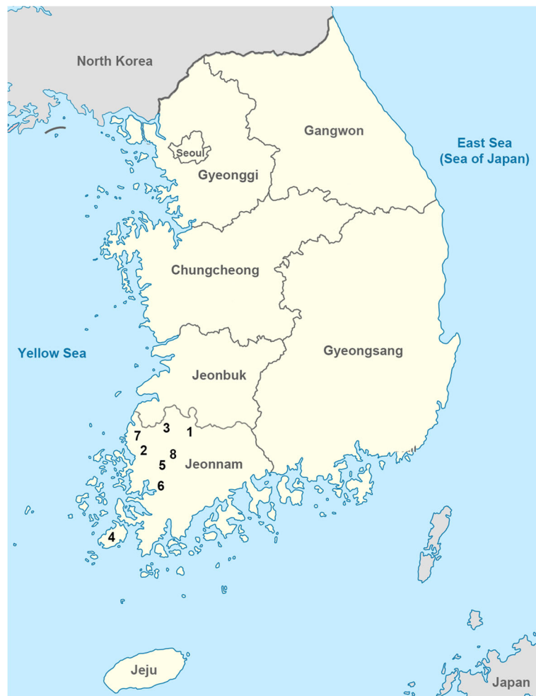
Fig. 1 Map of the study area in the southwestern Korean Peninsula. Flea infestation was investigated in dogs from 8 local areas: Damyang (1), Hampyeong (2), Jangseong (3) Jindo (4), Naju (5), Yeongam (6), Yeongwang (7) and SongJeong (8)

Out of 116 dogs investigated in this study, 33 dogs (28.4%) were infested with fleas (Table 1). The highest